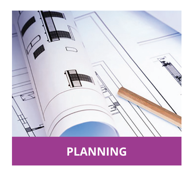
Digital Strategy Crafted